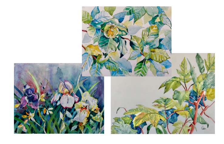
Free entry to view the exhibit Visit canyontheatre.org for hours

Online: <u>gallerymuse.art/pages/qiana-tarlow</u>