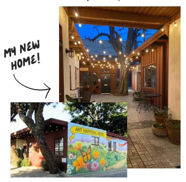
6TH & MAIN, OTN

Be sure to stop by the gallery to say hello! That's where I'll be hanging for 2024 with my AWESOME gallery crew!